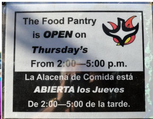
The Sign just outside of the food pantry