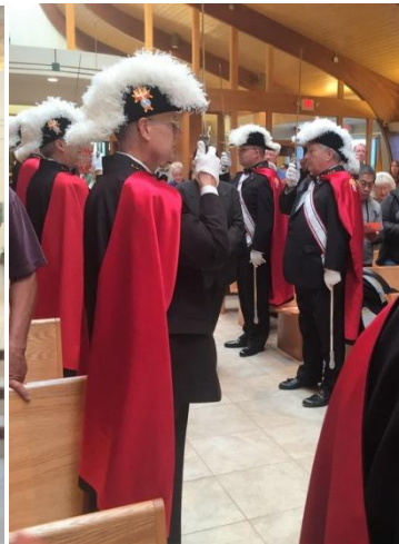
Forming the Honor Guard