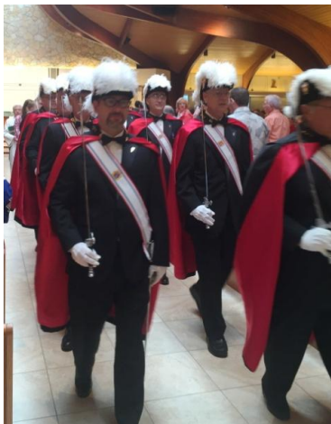
Walking into church