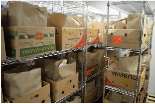
Food has been separated & bagged, ready to hand out