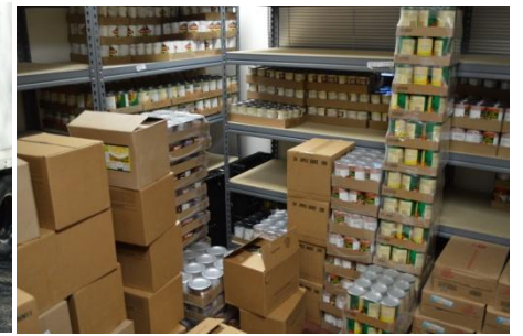
One of the many storage rooms used